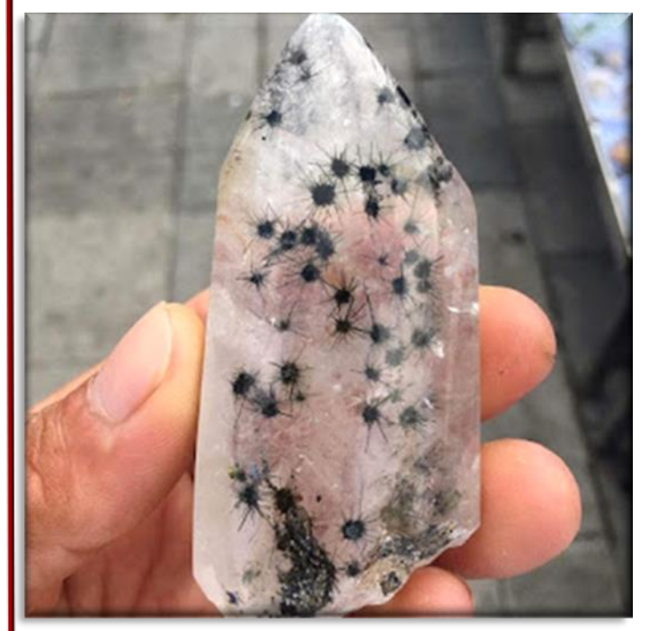
Rare Urchin Quartz (Quartz crystal with Mannardite phontom inside) from Brazil

Star Hollandite Quartz is a type of quartz crystal that has very small inclusions of Hollandite in it, that look like tiny black stars. Hollandite is an oxide mineral. A monoclinic-prismatic white mineral containing aluminum, barium, iron, lead, manga-