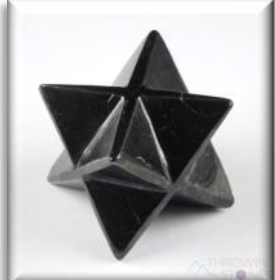
Shungite crystal mekaba-star

recently the term has also been used to describe shungite-bearing rocks , leading to some confusion. Shungite-bearing rocks have also been classified purely on their carbon content, with elite shungite having a carbon content in the range 90-98 weight percent, petrov sky shungite with carbon contents in the ranges 50-70 percent, and regular shungite with 30-50 percent carbon. It is further classified as bright, semi-bright, semi-dull, and, dull on the basis of its luster. Shungite has two main modes of occurrence, as disseminated within the host rock and as an apparently mobilized material. Migrated shungite , which is bright (lustrous) shungite, has been interpreted to represent migrated hydrocarbons and is found as either layer shungite , layers or lenses near conformable with the host rock layering, or vein shungite , which is found as cross-cutting veins.