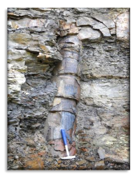
What in the World? Is this pipe-like feature imbedded in the rocks of this cliff??