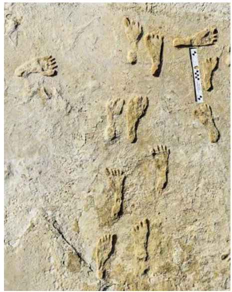
White Sands has the largest collection of fossilized human footprints.