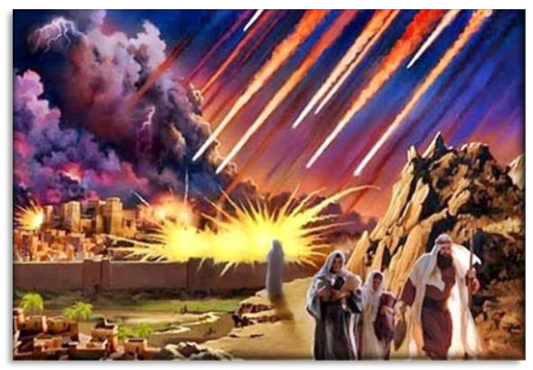
Artist's depiction of the destruction of Sodom.

As the inhabitants of an ancient Middle Eastern city now called Tall el-Hammam went about their daily business one day about 3,600 years ago, they had no idea an unseen icy space rock was speeding toward them at about 38,000 mph. Flashing through the atmosphere, the rock exploded in a massive fireball about 2.5 miles above the ground. The blast was around 1,000 times more powerful than the Hiroshima atomic bomb. The shocked city dwellers who stared at it were blinded instantly. Air temperatures