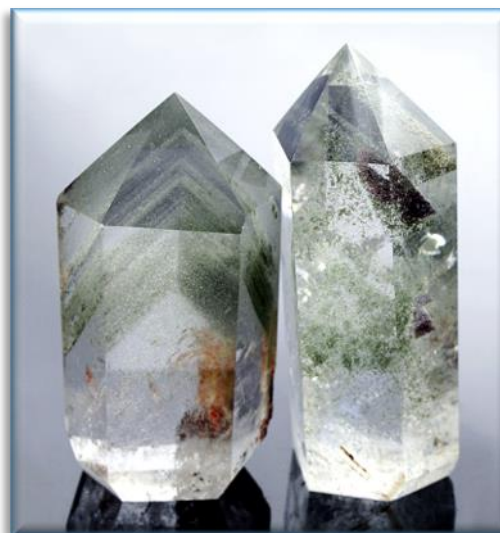
Other examples of Green Phantom Quartz Crystals show the quartz phantoms outlined by green chlorite crystals

tion can reoccur multiple times during the crystal's growth, producing multiple stacked phantoms, much like Russian Matroska puppets. The phantom is often very faint and ghost-like. Very little information on the formation and occurrences of green phantom quartz could be found. However, one of the sources of this rare variety of quartz appears to be the Himalayan Mountains of Tibet and China..