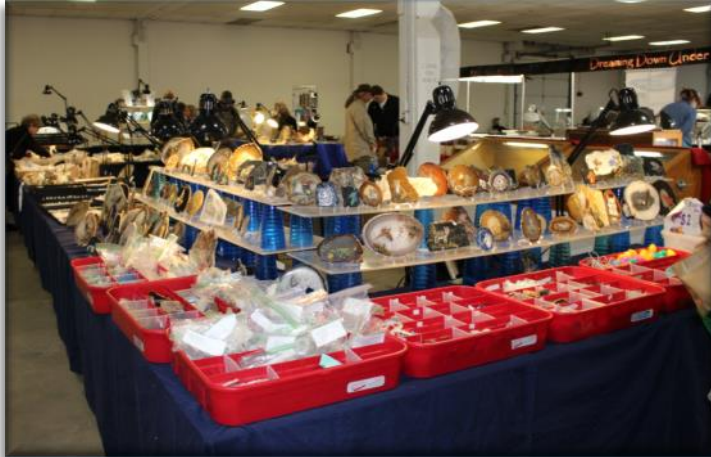
Aerie Artwork treasures