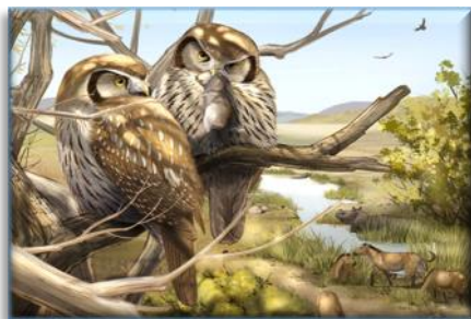
Miomurina diurna , an extinct owl found in a Chinese fossil formation, probably looked similar to some of the diurnal owls today.

Not every owl is a night owl. Of the 200-plus owl species that fly the world today, the vast majority are nocturnal or crepuscular and hunt at dusk, night, or dawn. But a select few are diurnal or cathemeral, meaning they're most active in the daytime, or really, anytime. This can be determined by a species' habitat, as well as their diet. For example, snowy owls spend their summers in the Arctic, when the sun stays up for