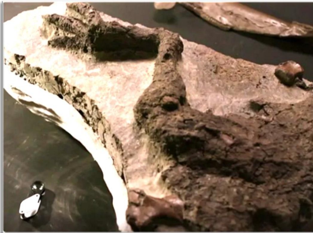
The fossil of a dinosaur which scientists believe was killed on the day of an asteroid strike 66 million years ago

moment paleontologists, who had been digging at the site for a decade, discovered a dinosaur leg belonging to a thescelosaurus , a small herbivore. "Never before has a dinosaur victim of the asteroid strike been found," the broadcaster reported. The BBC reported that the team had also found the fossilized remains of a turtle that was skewered by a wooden stake and small mammals and their burrows, as well as skin from a triceratops , a pterosaur embryo inside its egg, and what scientists think could be a fragment from the asteroid impactor itself. The Chicxulub asteroid, which was approximately the size of Mount Everest, hit the Gulf of Mexico. The impact of the asteroid caused tremors which resulted in tsunamis and flash floods that swept