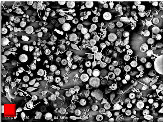
Eocene (55-34 million years ago) radiolarian ooze seen through a Scanning Electron Microscope. Red square is 300 \mu\text{m} .