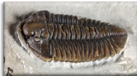
Silurian trilobite Calymene niagarensis

By the third extinction , the end-Permian , the competition, predators and environmental changes had flipped the odds against the ancient Proetida . They couldn't withstand the global warming events set in motion by the volcanic eruptions. The specifics of what made the trilobites so resilient, and yet so vulnerable, is still very much under study. One way to learn more about why they went extinct is to figure out why they never diversified again to the same extent. But that question remains unanswered.