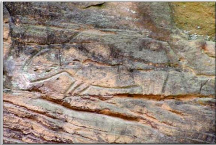
What in the World is this figure etched into sandstone and where is it??