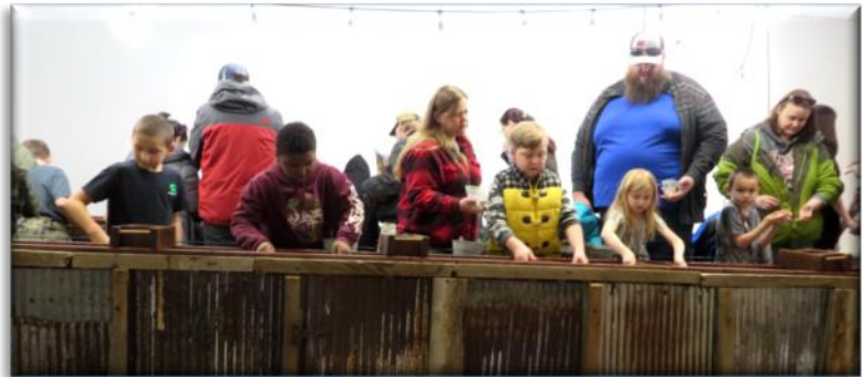
panning for gold and gems at J.L. Treasures