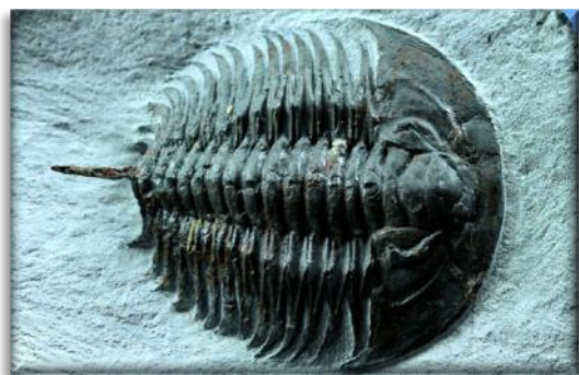
Early Cambrian trilobite Redlichiid

Trilobites are weird creatures; they look like giant swimming potato bugs wearing helmets, and lived on Earth for a whopping 270 million years. These armored invertebrates, whose species once numbered in the thousands, thrived in the oceans as they scavenged and dug for food, and even managed to survive two mass extinctions. But about 252 million years ago, trilobites disappeared from the fossil record. What finally wiped out this class of resilient bottom dwellers? The trilobite's disappearance coincided with the end-Permian extinction (also known as the Permian-Triassic extinction ), the third and the most devastating mass extinction event. Volcanic eruptions in Siberia spewed enormous amounts of lava for around 2 million years, sending trillions of tons of carbon dioxide into the atmosphere, and triggering ocean acidification making it very difficult for marine animals to survive. Up to 95% of marine species, including the trilobites, succumbed to the end-Permian extinction, also known as the Great Dying . The trilobites, however, had already started a downward spiral toward extinction by that point. Environmental and evolutionary changes had whittled away at this class of creatures.