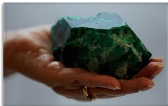
The world's largest uncut emerald

May's birthstone, the emerald, is one of the most regal of all and one which denotes life and love. It is also one of the most valuable (the very highest quality emeralds can be more expensive than diamonds). Emeralds are the deep green variety of the mineral beryl [\text{Be}_3\text{Al}_2(\text{Si}_6\text{O}_{18})] , colored by the element chromium. Emeralds are very hard, 7.5-8 on the Mohs scale. The best emeralds are found in South America, having been cherished by the Inca and Aztec peoples, who regarded emerald as a holy gemstone. In contrast, "Cleopatra's Mines" in Egypt had already been exhausted by the ancient Egyptians, so that when they were rediscovered in the 19th century, there was simply nothing left! These are only a few of the cultures which treasured this gemstone. In Roman times, emerald was associated with Venus, goddess of beauty and love. Its pigment was so venerated that Pliny remarked that green "gladdened the eye without tiring it!" It is also valued in the Catholic Church, green being considered the most elemental and natural of the colors used in their worship. The Vedas, Hinduism's oldest scriptures, acknowledge the healing powers of emeralds, promoting well-being as well as good fortune. Emeralds are also highly prized in Islam - green was the Prophet Muhammed's favorite color, and all dwellers of paradise are said to be dressed in green. In the 1960s, the