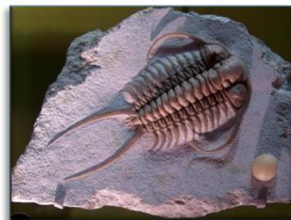
Middle Ordovician trilobite Cheirus ingricus