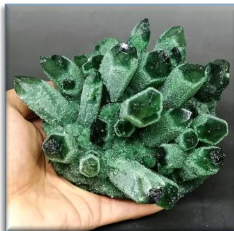
Green Phantom Quartz Crystal Cluster

Quartz ( \text{SiO}_2 ) is the most abundant single mineral on earth. It makes up about 12% of the Earth's crust, occurring in a wide variety of igneous, metamorphic and sedimentary rocks. An outline of the shape of a smaller crystal that is visible inside a crystal is called a ghost or a phantom . In the case of green phantom quartz