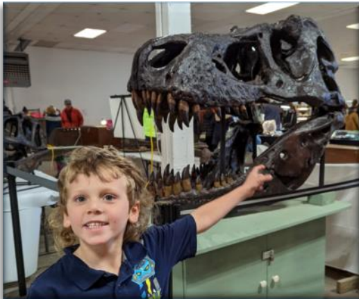
Sue the T-Rex and fan