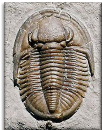
Proetida , the Late Devonian extinction survivor