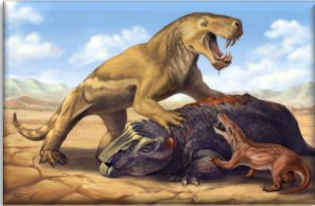
A hulking inostrancevia scares off the much smaller cyonosaurus

About 250 million years ago, widespread volcanic eruptions changed the earth's atmosphere and thus its climate, setting off "The Great Dying," otherwise known as the Permian extinction .