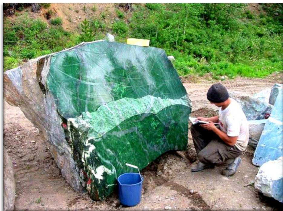
The Jade Deposits in Canada. The Polar Pride boulder—called “the find of the millennium” by trade experts—was discovered in Canada. The 18-ton boulder was split in half for carving.

Jade is a commercial term encompassing green, white, black or yellow-brown material that consists either of Na-rich pyroxene ( jadeite ) or prismatic to acicular amphiboles of the tremolite-actinolite series that form bundles that are randomly oriented and interlocked ( nephrite ). Nephrite is tougher (harder to break) than jadeite material. Its fracture strength is about 200 MN/m 2 whereas that of jadeite is about 100 MN/m 2 . On the other hand, jadeite material is harder (7 compared to 6.5 on the Mohs scale).