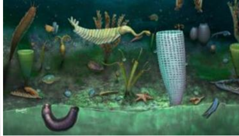
A reconstruction of the Castle Bank fossils.

An "extraordinary" secret fossil spot in Wales contains the preserved eyes and brains of 462 million-year-old creatures hidden amidst a hoard of unknown species, a new study finds. Last year, weird " bramble snout fossils " were documented at the site called "Castle Bank," but new research published May 1 in the journal Nature Ecology and Evolution